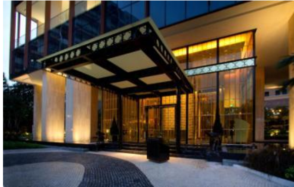
Singapore Singapore - First in Asia

The Ritz-Carlton Residences, Asia Pacific