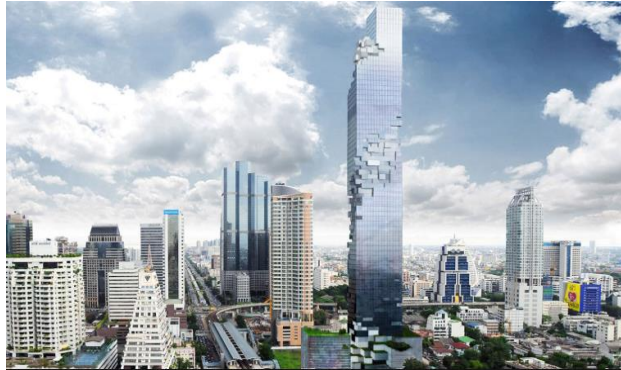
Sri Lanka Colombo