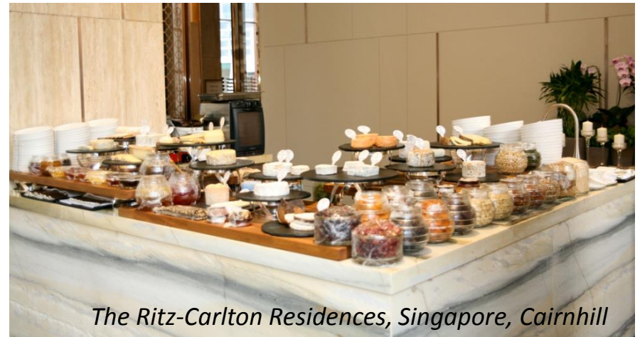
The Ritz-Carlton Residences, Singapore, Cairnhill