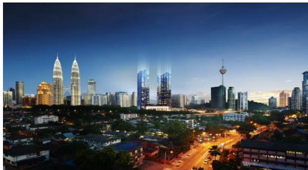
Malaysia Kuala Lumpur